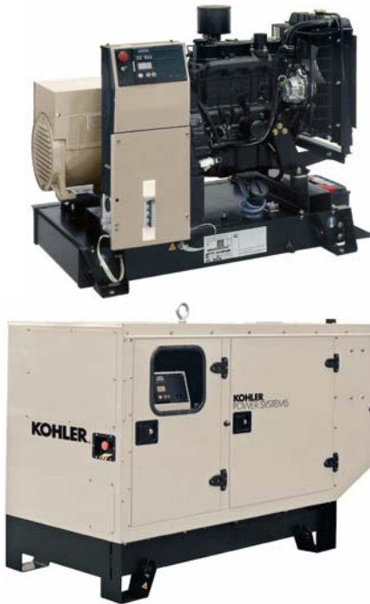
With Available Enclosure Accessory